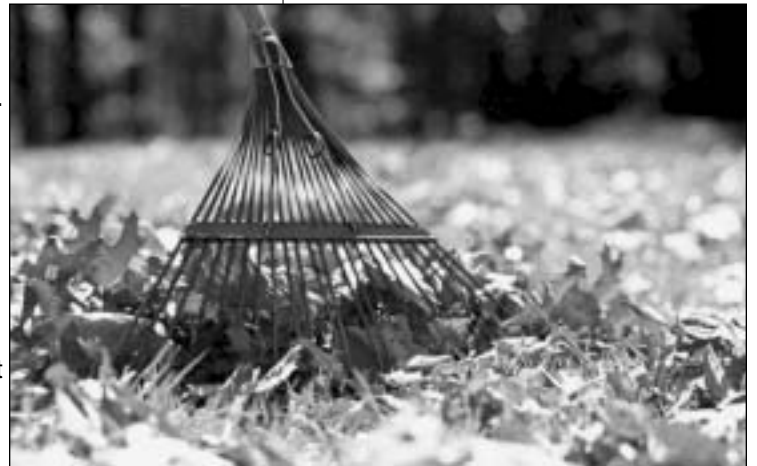
Bagging is not the only option for disposing of yard waste.

Still want to register the "old fashioned way"? Just stop by the Parks and Recreation office at 3310 86th Street, or call 515.278.3963 . (Credit card orders can be taken over the telephone too!)